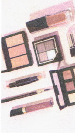
Believe Beauty by Doherty Creative Design