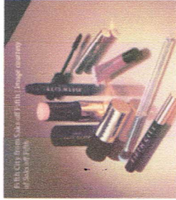
BELEI from Cusani Photo Design courtesy of Saks Fifth Avenue