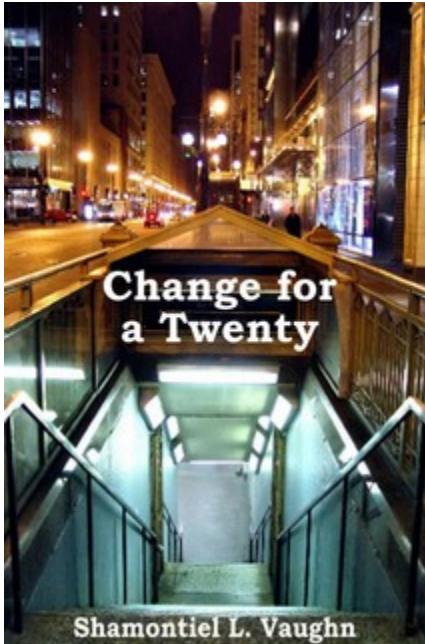
Cover Artist: Evan Hunt