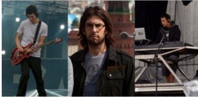
Linkin Park

In the filing of an amicus brief on Tues., Aug. 30, with the 9th Circuit Court of Appeals, the artists approved the following statements: