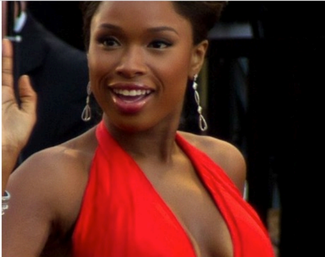
Jennifer Hudson