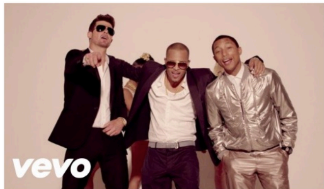
Robin Thicke - Blurred Lines ft. T.I., Pharrell